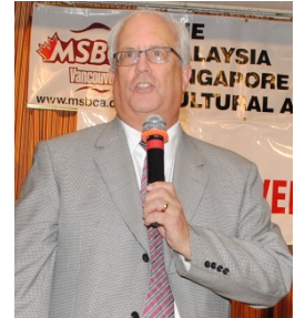
Mayor of the City of Richmond, Mr. Malcolm Brodie