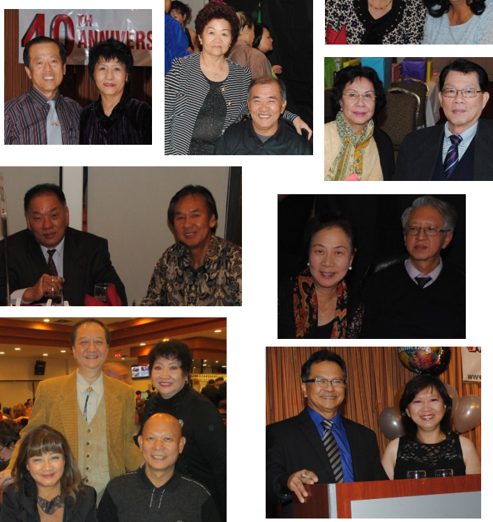
Snapshots from the 40th Anniversary Dinner on October 15, 2016.