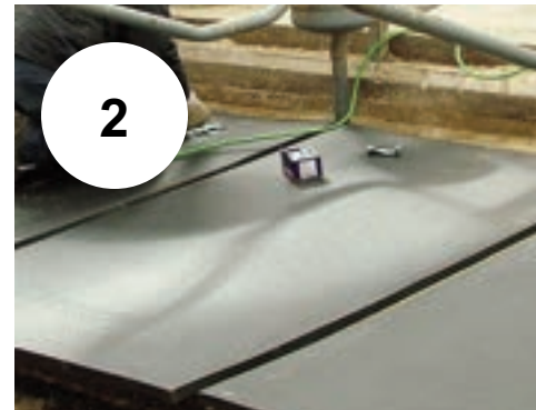
Lay the mats in the stalls a minimum of 2 inches apart. The gap is absolutely essential to allow for the expansion which occurs in the first few months. Don't worry about the gap filling with bedding...the Mayo Mat material is rigid enough that bedding does not work its way under the mat.

Tools needed: a hammer drill and a hammer. In most installations the mats may have to be shortened so you will also need a sharp knife and a chalk line. We recommend a low cost utility knife with "snap-off" blades. It is also helpful to use some kind of 2 inch spacer to ensure mats are always at least 2 inches apart.