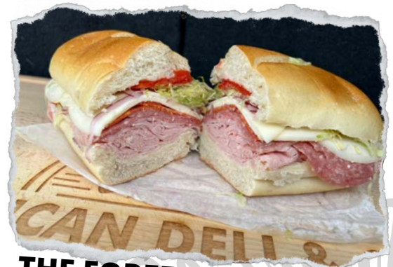
THE FOREFATHERS HERO