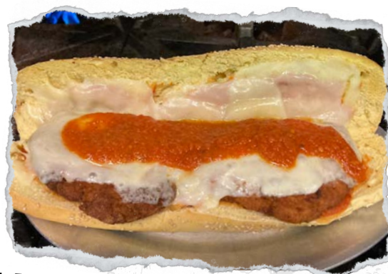
CLASSIC PARMESAN SANDWICHES