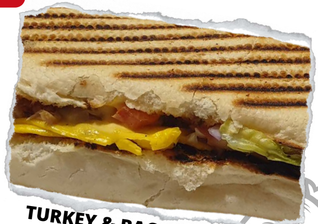
TURKEY & BACON PANINI

Shredded Chicken, Buffalo Sauce, Pepper Jack Cheese, topped with Blue Cheese or Ranch Dressing