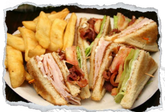
Triple Decker Club