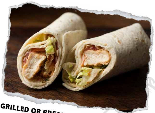
GRILLED OR BREADED CHICKEN CUTLET

29. CHEESE STEAK WRAP Steak, American Cheese, peppers, onions, mushrooms