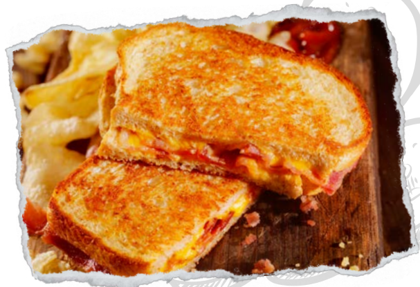
THE TRI-STATE ULTIMATE GRILLED CHEESE