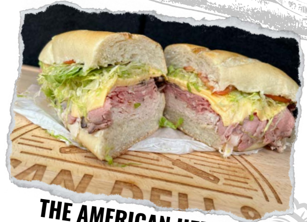
THE AMERICAN HERO

★ Ham, Salami, Provolone, Lettuce, Tomato, Red Onion, Oil.