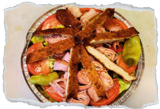
Antipasto Salad with Crispy chicken