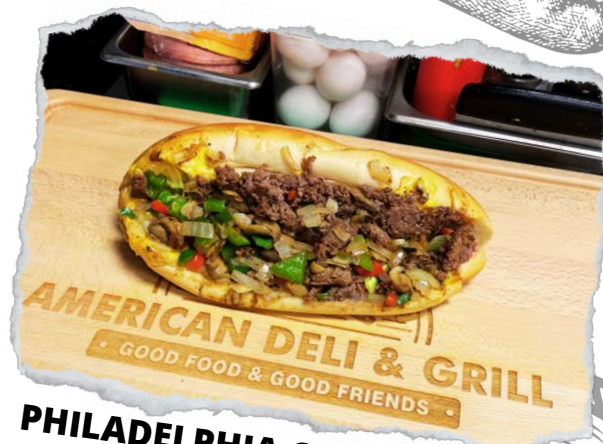
PHILADELPHIA CHEESE STEAK

Hot Corned Beef or Pastrami, melted Swiss, Sauerkraut or Cole Slaw & Russian Dressing on Rye