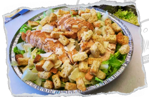
Caesar Salad with Chicken