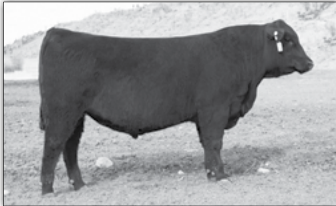
JVC Spur 2040 - Lot 53