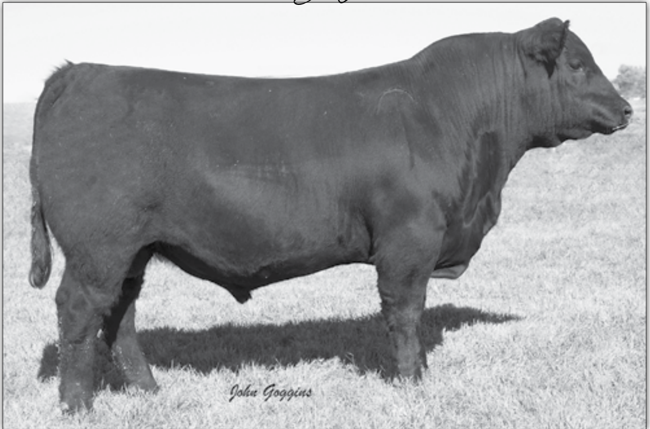
Vermilion Spur E870