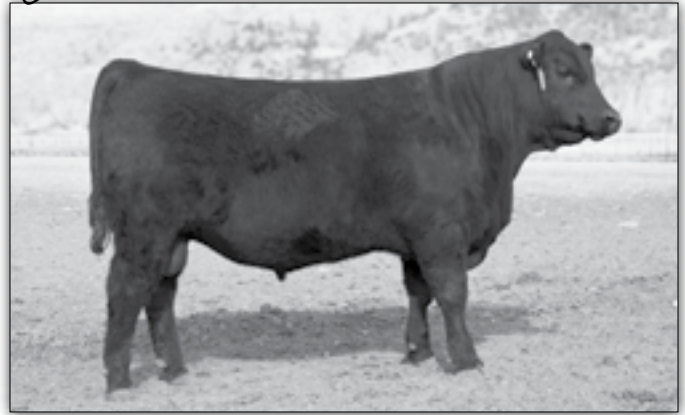
JVC Spur 2029 - Lot 48