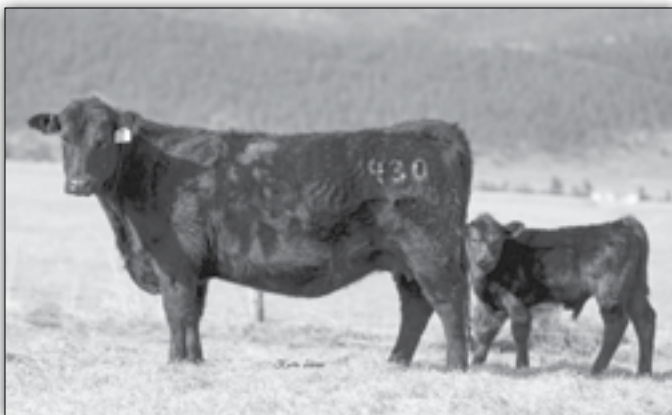
JVC Everelda Entense 930 - Lot 95