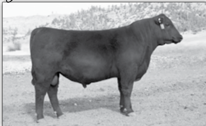
204 - Lot 4