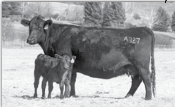
JVC Lucy A327 - Lot 88