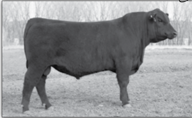
JVC Spur 206 - Lot 6

BD: 01-16-2020 | BULL +19643769 | TATTOO: H5