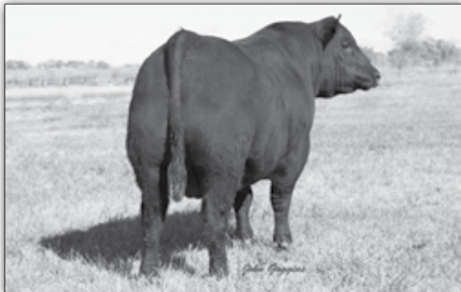
Vermilion Spur E870