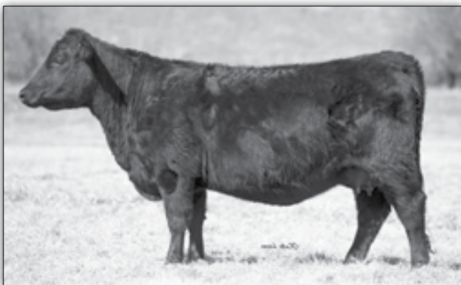
JVC Everelda Entense 930 - Lot 95

Lot 94A JVC Ideal 2164 || Cow 20026456 BW: 74 Sire: T/D Tiger 8106 (19142087)