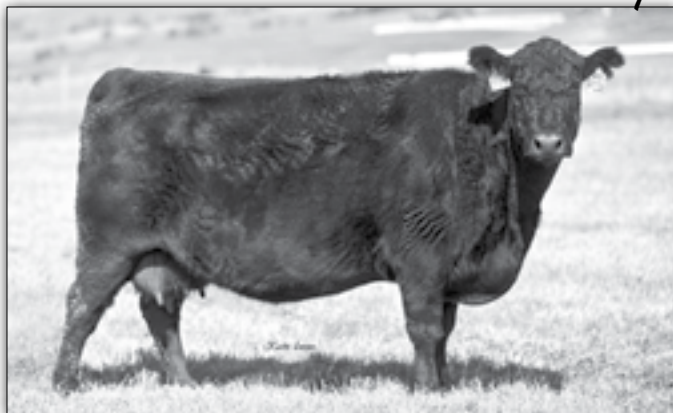
JVC Ideal 942 - Lot 83

Lot 85A JVC Spur 21150 || Bull 20026469 BW: 76 Sire: Vermilion Spur E870 (19053226)