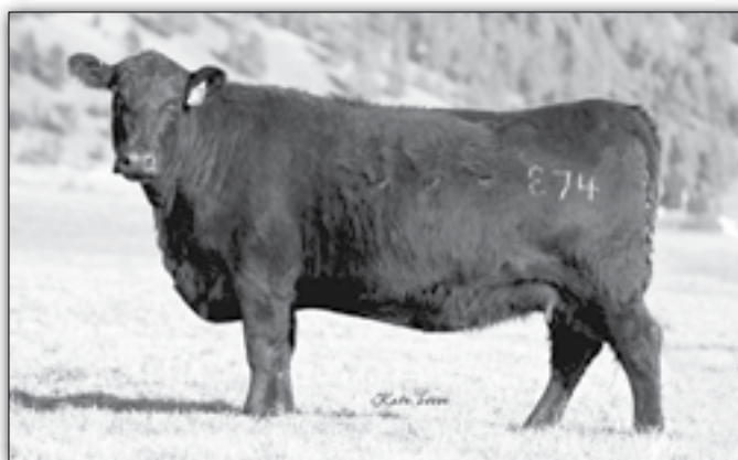
JVC Blackbird E74 - Lot 90

Lot 90A JVC Spur 21149 || Bull 20026465 BW: 80 Sire: Vermilion Spur E870 (19053226)