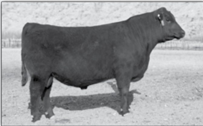
JVC Spur 247 - Lot 21