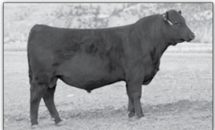
JVC Spur 279 - Lot 28