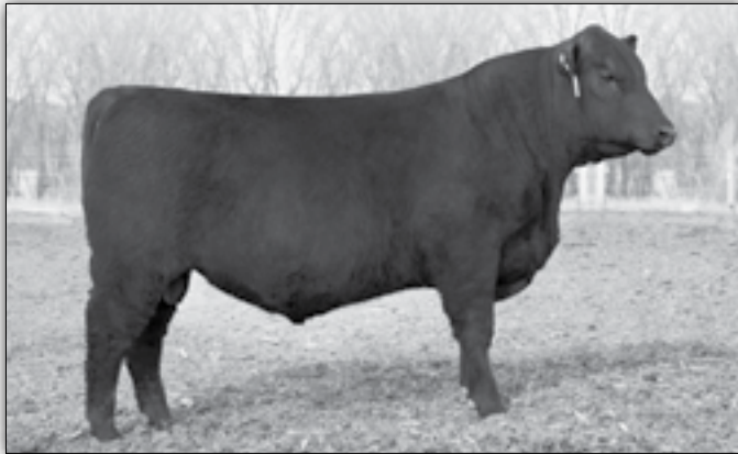
JVC Spur 2025 - Lot 47