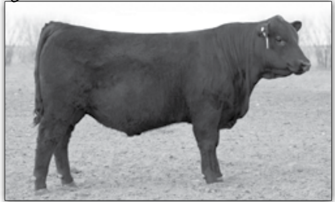
JVC Spur 299 - Lot 36