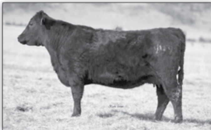
JVC Precision 949 - Lot 97

Lot 96A JVC Tiger 2196 || Bull 20026470 BW: 64 Sire: T/D Tiger 8106 (19142087)