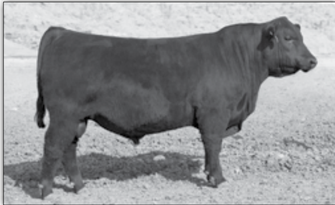
JVC Tiger 239 - Lot 14