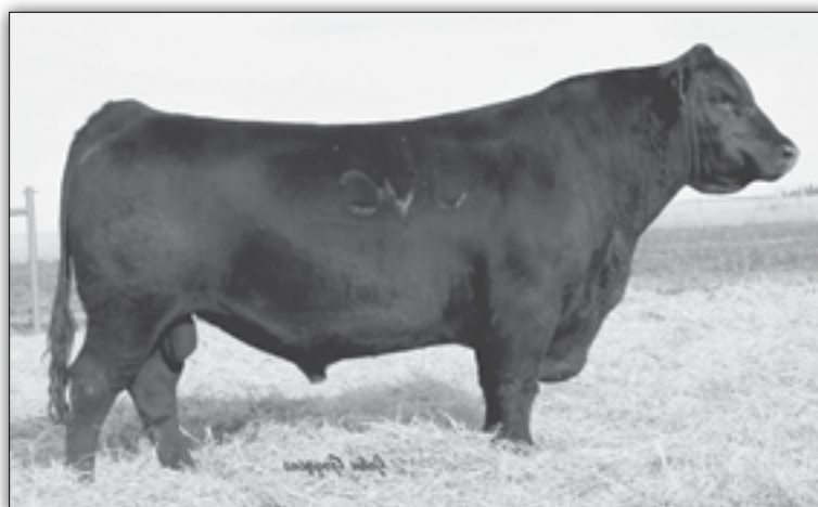
JVC Cavalry V3326 - Sire of Lots 2, 5