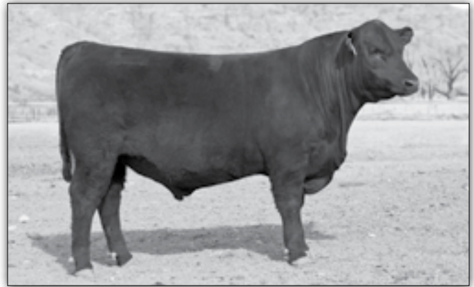
JVC Spur 260 - Lot 23