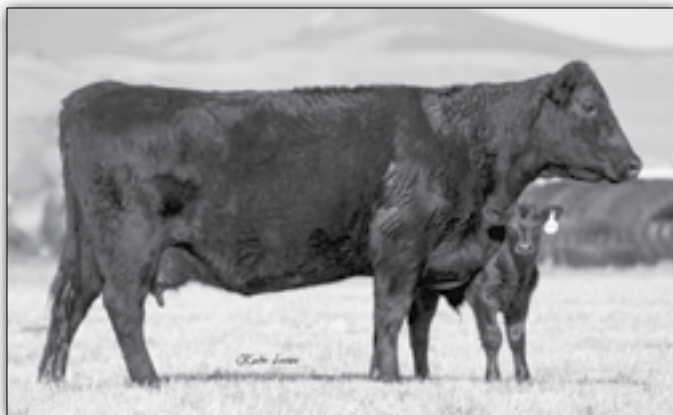
JVC Primrose Y101 - Lot 84

Lot 87A JVC Spur 21153 || Bull 20026466 BW: 92 Sire: Vermilion Spur E870 (19053226)