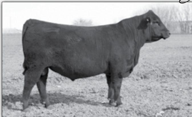
JVC Cavalry 29 - Lot 2