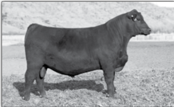
JVC Capitalist H7 - Lot 7