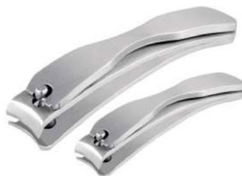
MJW-1558-80 (8cm) MJW-1559-60 (6cm) Nail Clippers