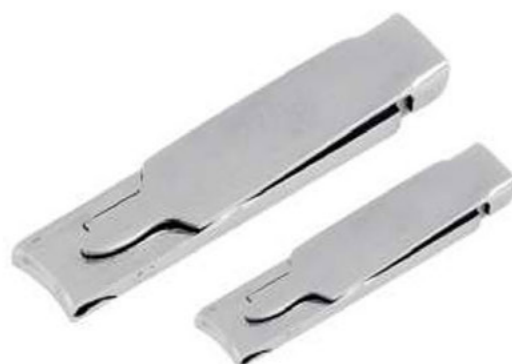
MJW-1556-80 (8cm) MJW-1557-60 (6cm) Nail Clippers