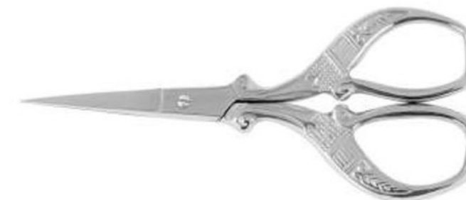
MJW-1115-90 (Straight blade) Embroidery Scissors real screws Size 9cm