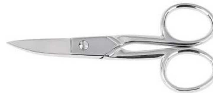
MJW-1105-100 (Straight blade) MJW-1106-100 (curved blade) Nail Scissors real screw Size 10cm