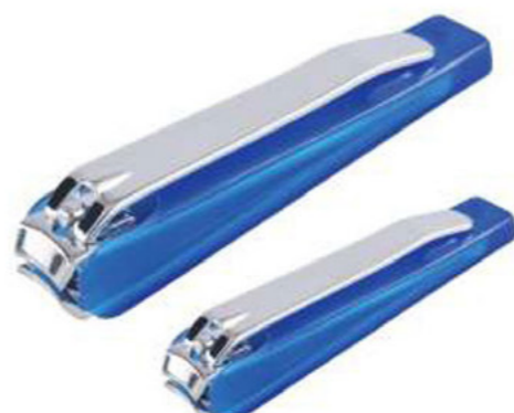
MJW-1550-80 (8cm) MJW-1551-80 (6cm) Nail Clippers