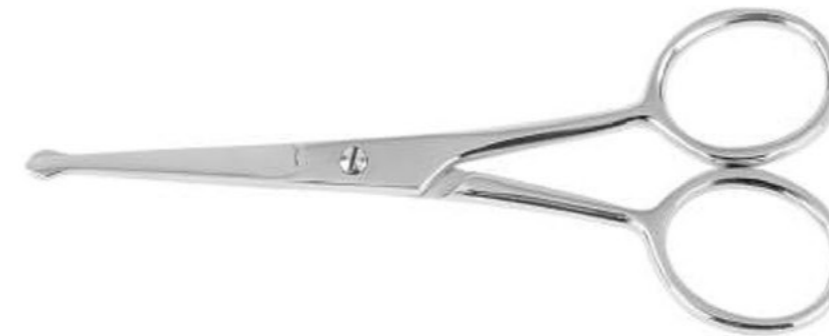
MJW-195-115 (Straight blade) Nose Hair Scissors real screw Size 11.5cm