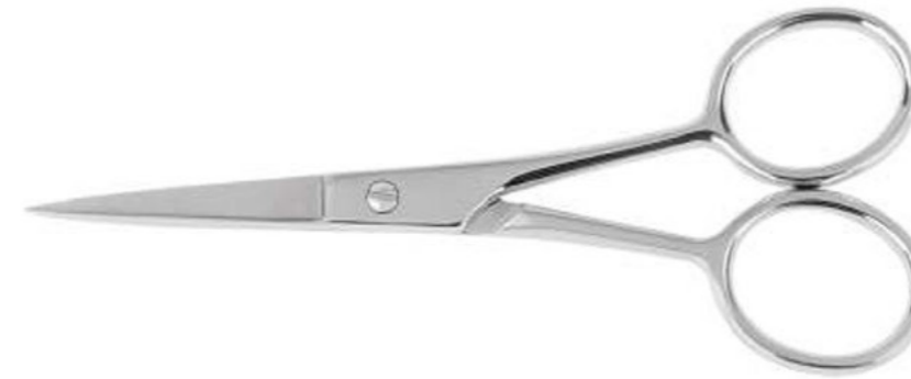
MJW-190-115 (Straight blade) Moustache Scissors real screw Size 11.5cm

It doesn't matter whether you have oily skin, dry skin, or sensitive skin; we have the tools you need for the results you will love.