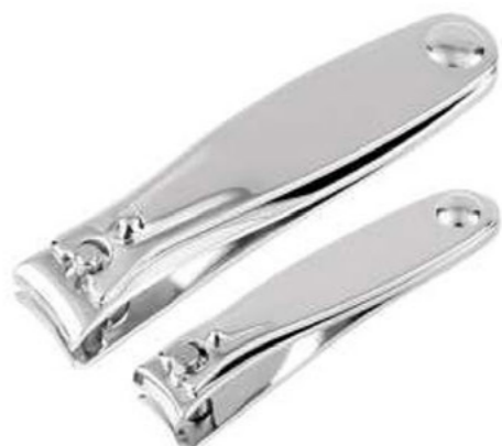
MJW-1552-80 (8cm) MJW-1553-60 (6cm) Nail Clippers