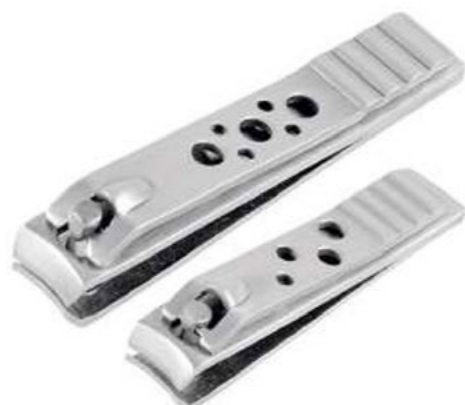
MJW-1554-80 (8cm) MJW-1555-60 (6cm) Nail Clippers