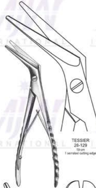
TESSIER 28-129 19 cm 1 serrated cutting edge