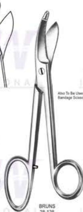
BRUNS 28-128 24 cm Open sharps with pin, serrated