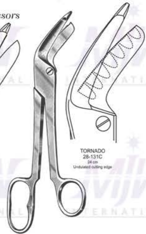
TORNADO 28-131C 24 cm Undulated cutting edge