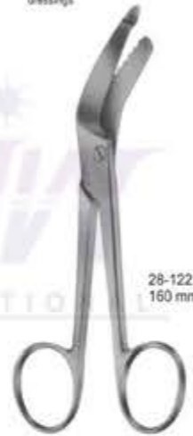
28-122 160 mm