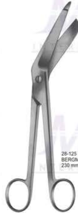
28-125 BERGMANN 230 mm