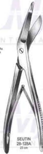
SEUTIN 28-128A 23 cm