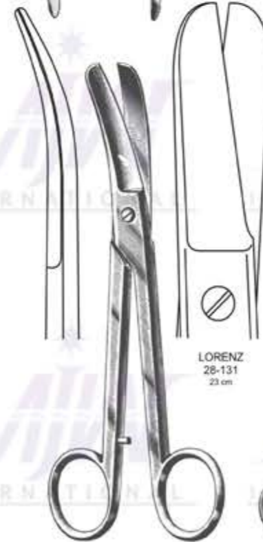
LORENZ 28-131 23 cm