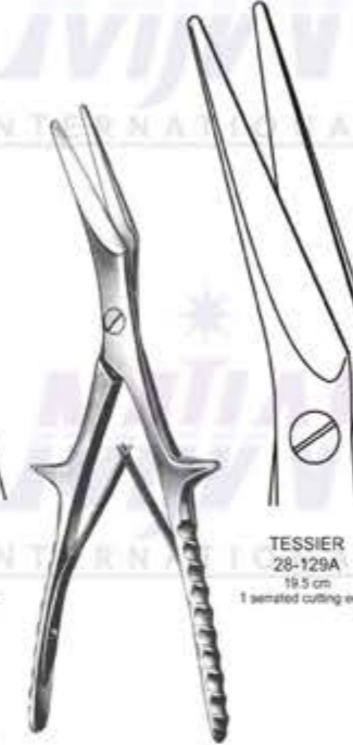
TESSIER 28-129A 19.5 cm 1 serrated cutting edge