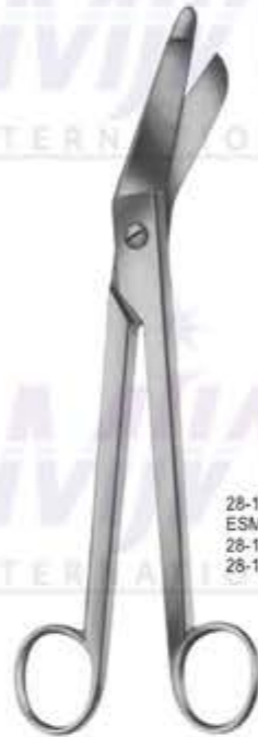
28-123 - 124 ESMARCH 28-123 200mm 28-124 230mm