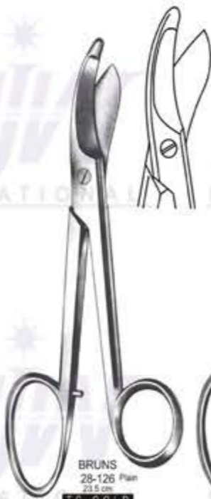
BRUNS 28-126 Plain 23.5 cm 28-126A serrated 24 cm Open sharps with pin