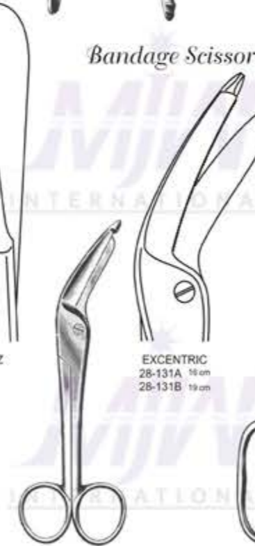
EXCENTRIC 28-131A 16 cm 28-131B 19 cm