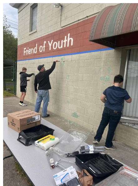
Bringing Out The Best In Kids Since 1936