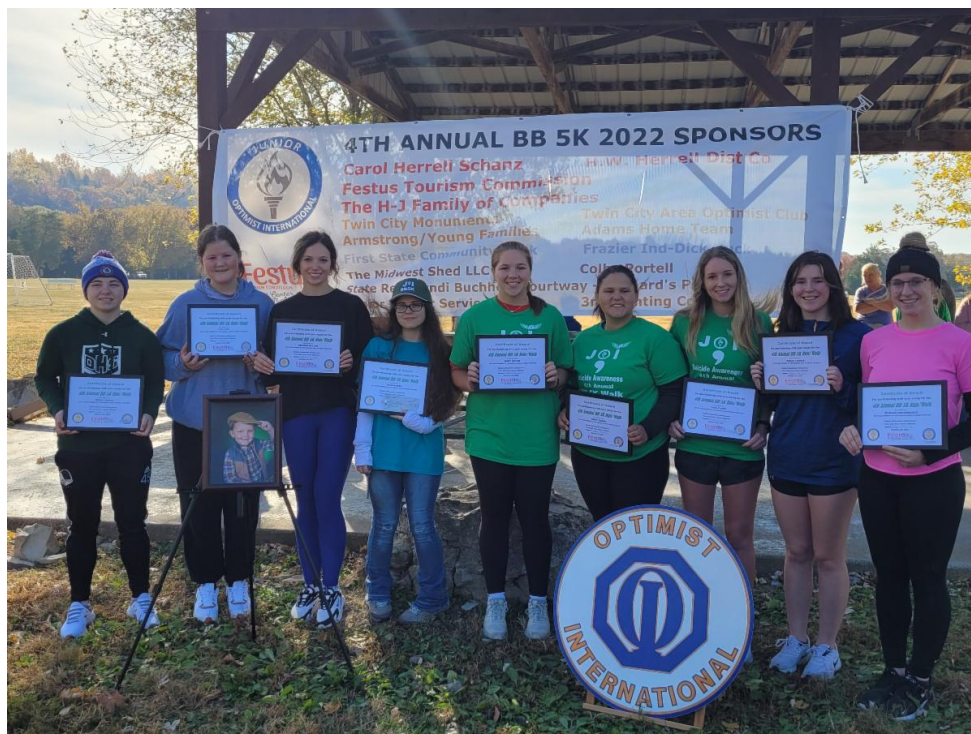
Essay winners for 4 th Annual BB 5K 2022 (pictured in order as noted below.)

Recently our Junior Optimist Club (JOI) held its fourth annual BB 5K Walk for Suicide Prevention on Saturday, October 22nd. Area students were asked to write an essay entitled: "What are your thoughts about a class being offered in our school on mental health awareness?" Winners were recognized at the walk and received scholarships.