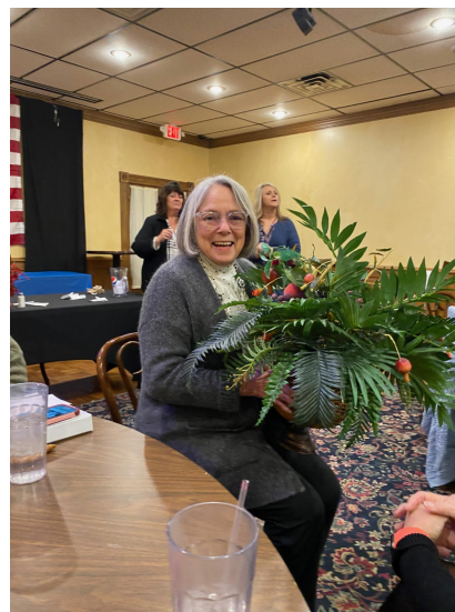
Apparently, the fern was a big hit.