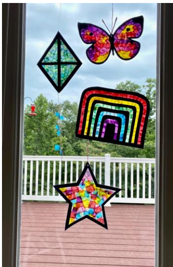
Optimist Patty Meyer's Art Challenge