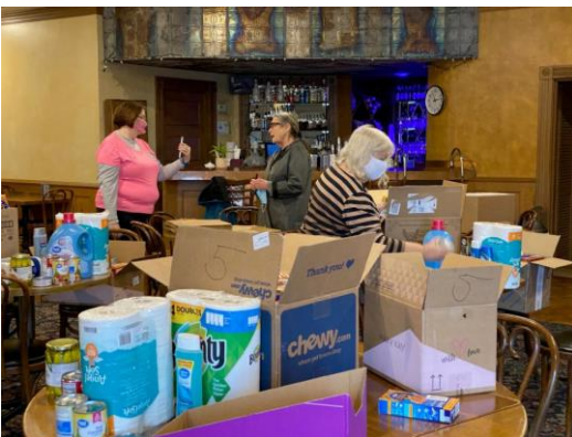
As you can see our members came through yet again to provide a tremendous amount of food and personal care products.