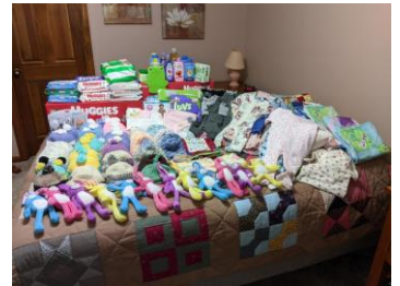
All the donations