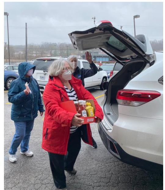
Members braved the cold and rain!