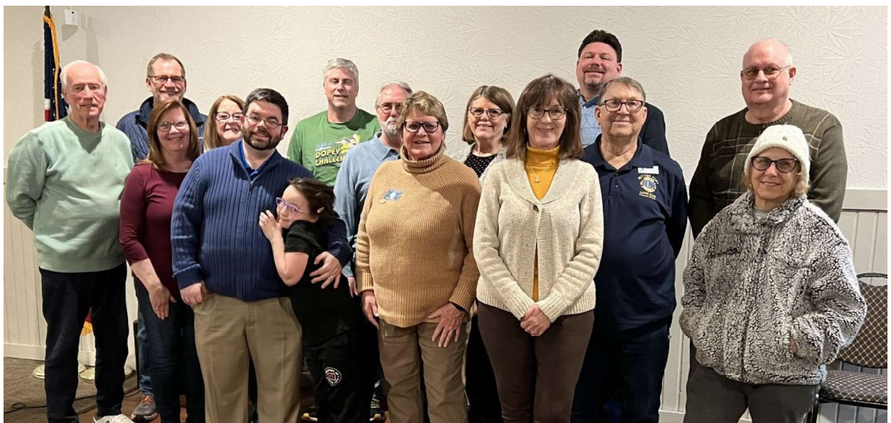
Zone 8 attendees at January 31st meeting - planning meeting - awesome group of Lions