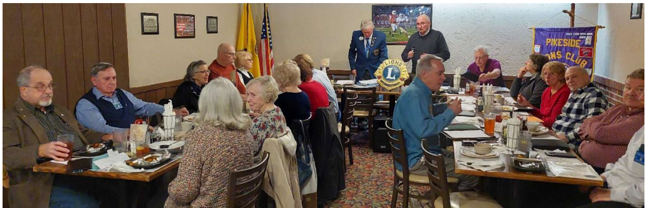
Fun, food and fellowship with Martinsburg, Hedgesville, PikeSide and Inwood Bunker Hill Lion Clubs.