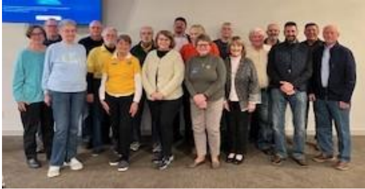
Zone 8 meeting on November 1. All six clubs were represented - Bridgeport, Clarksburg, Harrison County HOPE, Grafton, Nutter Fort and Stonewood.