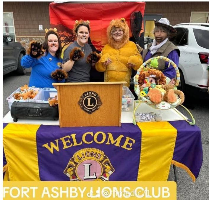
Fort Ashby Lions Club members at local Trunk or Treat Provided treats (non-candy) to 300 children