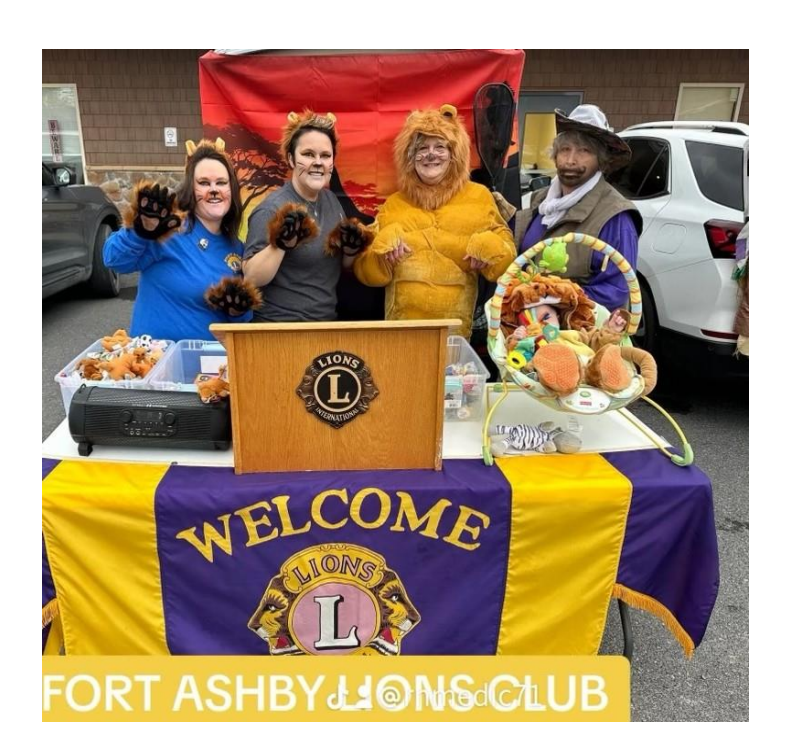
Fort Ashby Lions Club members at local Trunk or Treat Provided treats (non-candy) to 300 children