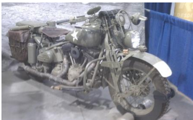
ANTIQUÉ HARLEY DAVIDSON