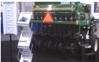
FOOD PLOT PLANTER