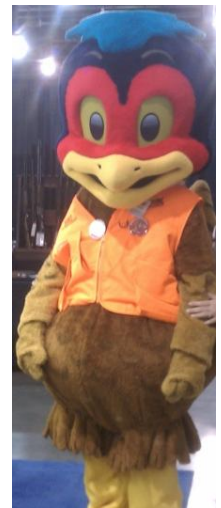
RUDY THE ROOSTER

There were many other interesting booths as well. Some of our favorites were the spinning target thrower, the food plot planter, the whiskey truck, and the new Beretta models.