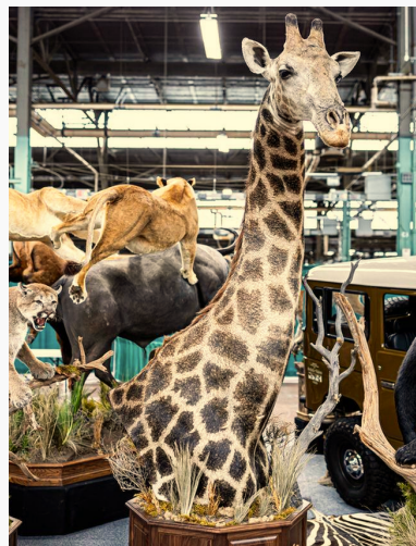
An exotic taxidermy display at GAOS

We closed out the first two months of the year in Charleston, South Carolina, attending one of our favorite shows: the Southeastern Wildlife Exposition, or SEWE. It has been a busy start to 2024 as we travel throughout the southeastern part of the country visiting numerous hunting shows. Also in February, we enjoyed the NRA's Great American Outdoor Show, where we were situated among 14 acres of exhibitors.