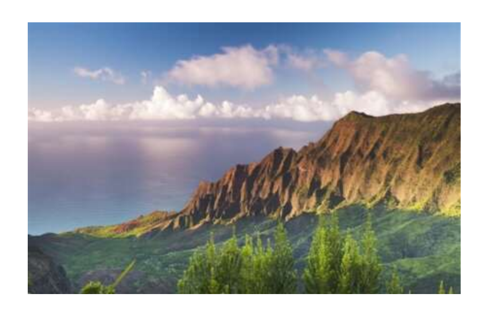
#10 in Best Honeymoon Destinations