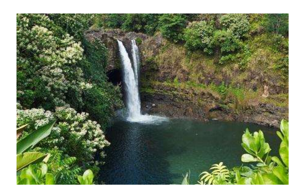
Hawaii - The Big Island