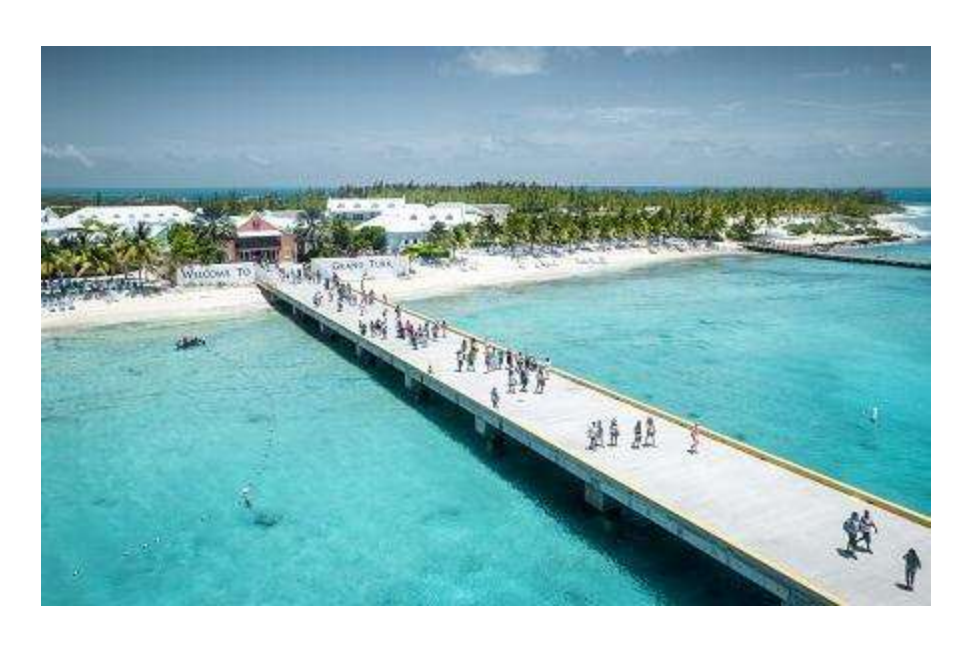
Turks & Caicos