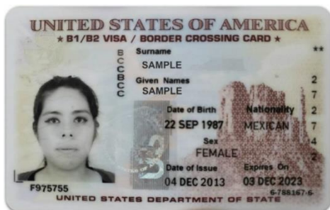
Border Crossing Card