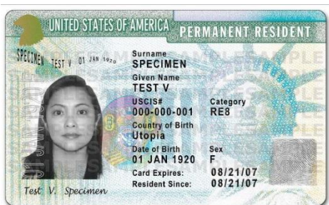
Resident Alien Card