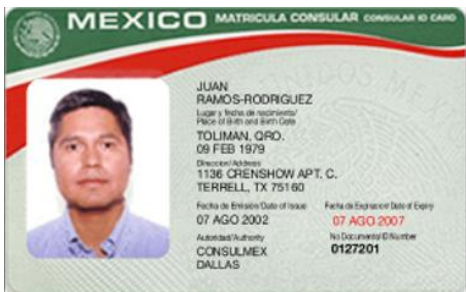
Consular ID Card