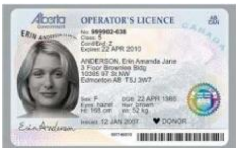
Canadian Driver's License or ID Card