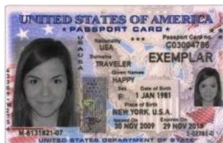
U.S. Passport Card

Any U.S. Driver's License or ID Card (Issued by D.M.V)