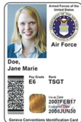
Military ID Card