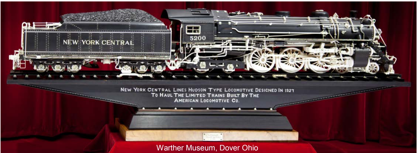
Warther Museum, Dover Ohio