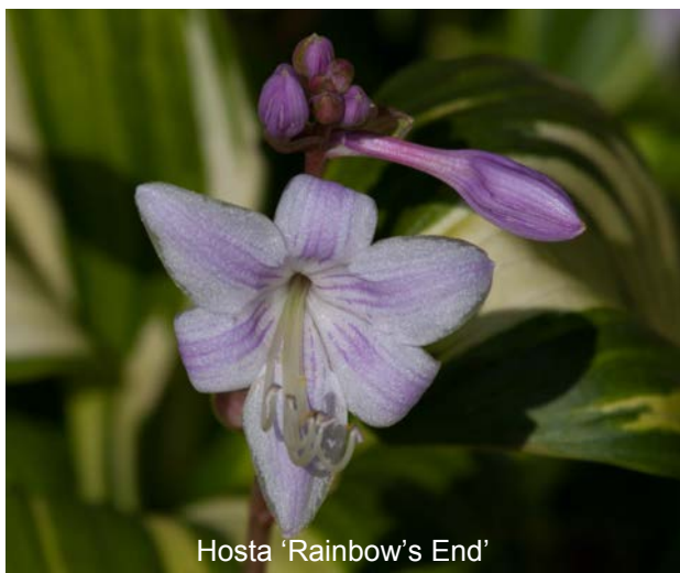
Hosta 'Rainbow's End'