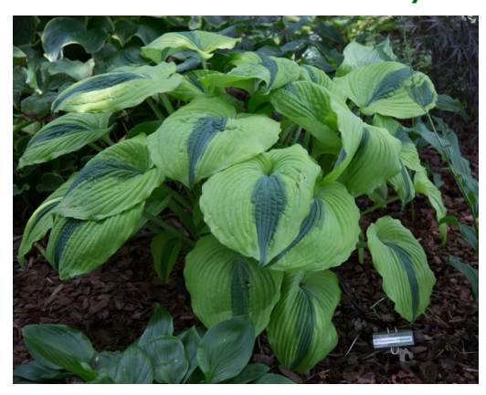
H. 'Goodness Gracious'