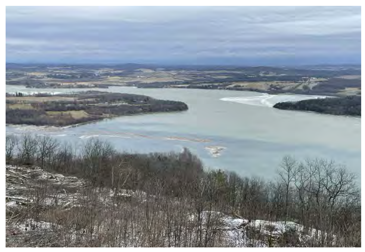
View of Lake Champlain from Mount Defiance in Ticonderoga on Martin Luther King Day, courtesy of Sandy Powell.

Learn more about the boat inspection program on Lake George and read the full report <u>HERE</u>.