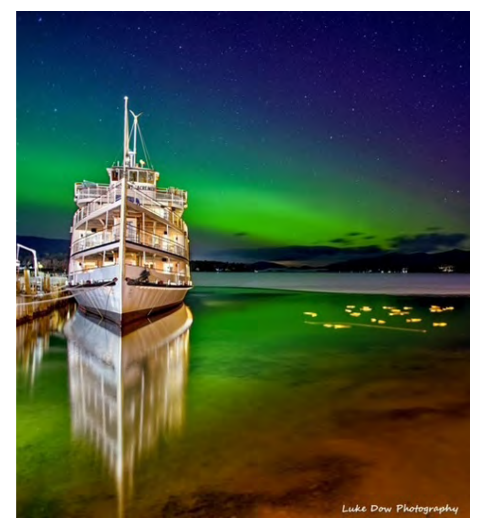
The Northern Lights over the Lac du Saint Sacrament in Lake George Village on Thursday, March 23, 2023.

Click HERE for additional information about sponsorship levels. Email us HERE to make a pledge.