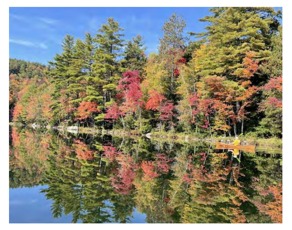
October foliage on Putnam Pond

For more information or to access the Ticonderoga Area Employment Opportunities database visit <u>www.ticonderogany.com</u> or contact Megan Bambara at <u>coordinator@ticonderogany.com</u>.