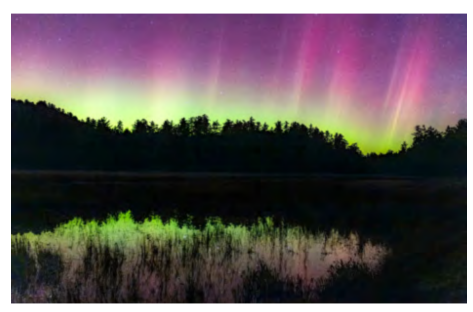
Aurora borealis on November 5, 2023 at Amy's Park

Over 70% of the grants made by the Cloudsplitter Foundation go to improve the environment, economies, and lives of the people in the Adirondacks.