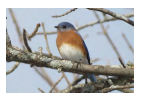
Bluebird on a branch during a past Christmas Bird Count

On December 16, 2023, you can volunteer for the annual Christmas Bird Count, conducted nation-wide by the Audubon Society and organized locally by the Lake George Land Conservancy (LGLC). The 15-mile bird-counting circle around Lake George includes Amy's Park in Bolton south to Pilot Knob Preserve in Fort Ann and the Schroon River in Warrensburg east to Sleeping Beauty and Black Mountain in Dresden.