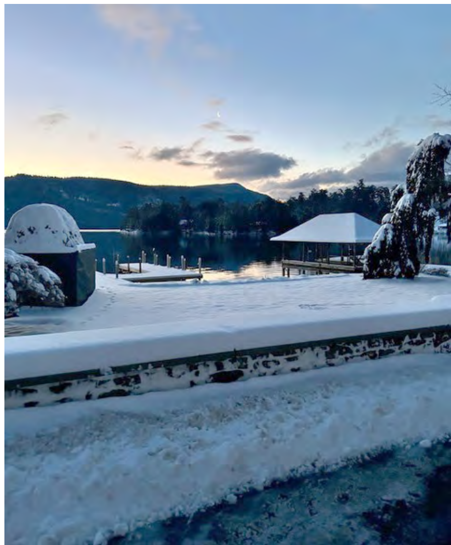
Cool January morning on Lake George