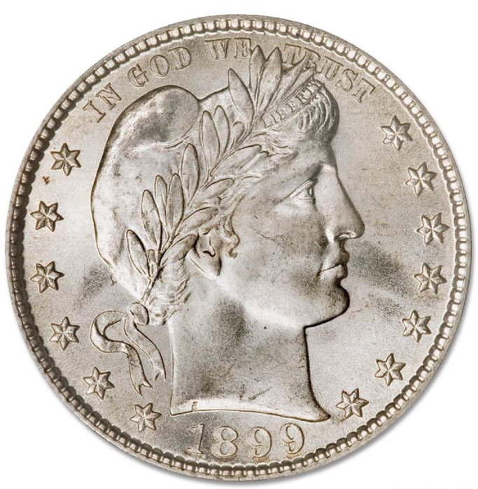
Mint State 68

While these prices are not excessive for most collectors, I still recommend that you consider examples that have been graded and encapsulated by one of the major grading services, and spend some time locating one that