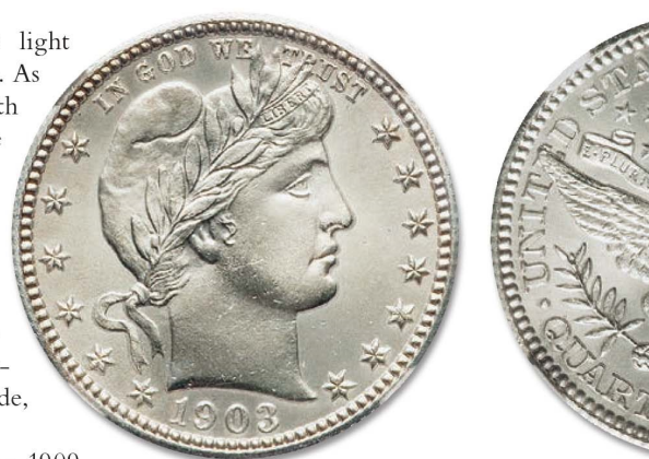
About Uncirculated 50 Details, Whizzed

Next up is a 1901-O Barber quarter dollar that grades MS-64. Contact marks are fewer and less noticeable at this grade level, and the overall eye appeal is better. When checking for striking weakness on a Barber quarter dollar, two areas to fo-