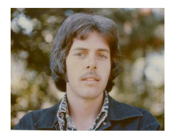
This picture is the summer of 1974 and I do not know where it was taken.