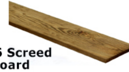
1 X 6 Screed Board