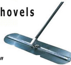
18" 1- Fresno Float On Pole

Handle Adpt - Kraft CC295 Float - Kraft CC618