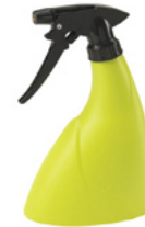
2- Spray bottles Fill with Form Release