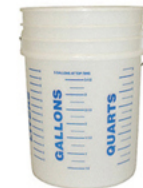
2 Large Measuring bucket