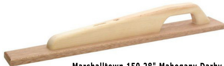
Marshalltown 150 28" Mahogany Darby Part# MT-14510