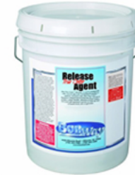
Concrete Form Release