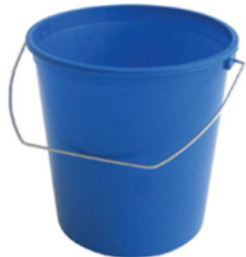
Water bucket Fill with water add dish soap