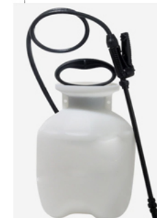
2 Garden Sprayer Fill 1 with form release & 1 with water