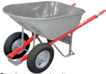
2 Ex Large wheelbarrow