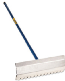
1- Concrete rake

Handle Adpt - Kraft CC295 Float - Kraft CC618