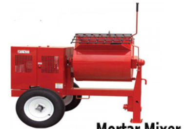
8-12 cu ft Mortar Mixer Paddle Type