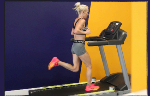
RUNNING GAIT ANALYSIS