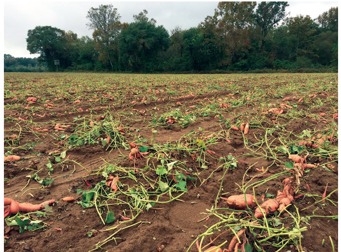
Figure 3. Note the row spacing and the acreage in the field.