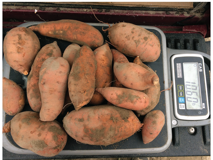
Figure 7. Accurately weigh each sample category.