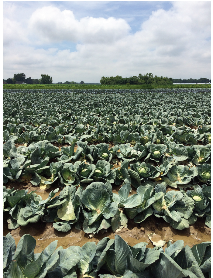
Figure 1. Field loss can amount to a significant portion of the harvested yield.

harvest. Knowing what volume and quality are left unharvested provides the opportunity to further market the crop, possibly to alternative markets.