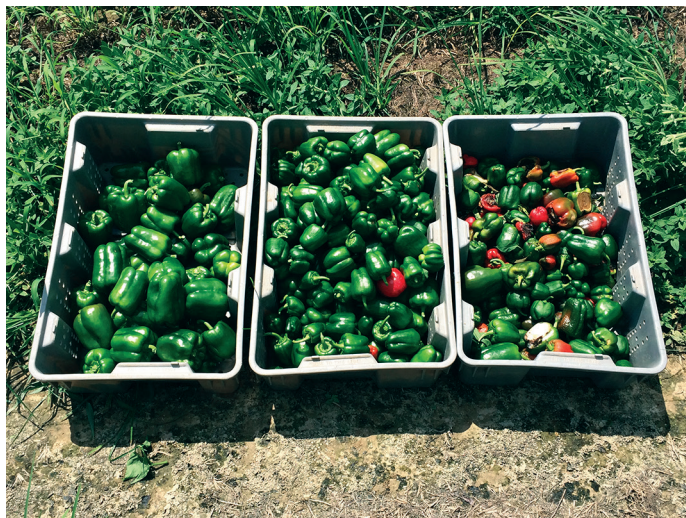
Figure 6. Peppers sorted into marketable (left), edible (center), and inedible (right).

decayed, overly mature, sun-scalded, or damaged vegetables that remain attached to the plant should be harvested for this measurement; that information will be important for calculations. In determining what portion of the remaining crop is edible or marketable, collect all sizes, even if they are considered immature. This will determine how much of the remaining crop was damaged by disease or is inedible for another reason. Do not collect vegetables that have fallen to the ground and are no longer attached to the plant.