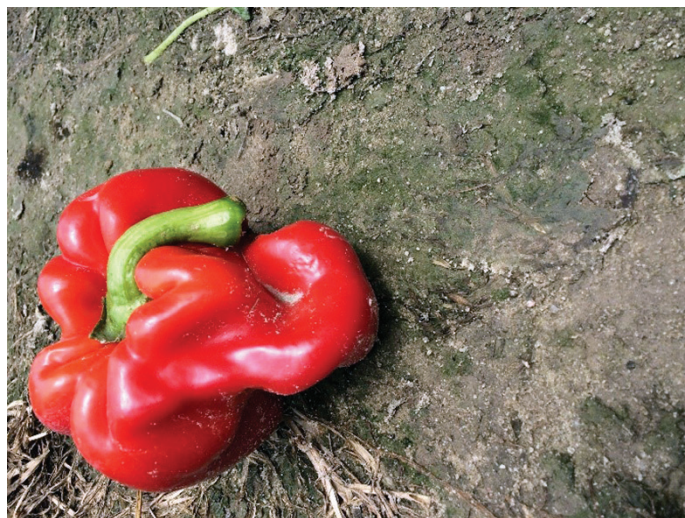
Figure 8. This is an example of previously unmarketable produce that now has a place in the supply chain.

In many production regions, it is possible to connect with buyers that will accept a wider range of quality or that have more flexible specifications. Large national companies and smaller, regional distributors are beginning to offer programs that purchase blemished and misshapen produce in a developing