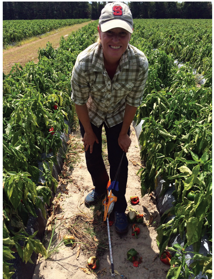
Figure 4. Choose and mark sample row locations.

locations in the field should be randomly chosen in areas of the field that seem representative of field conditions. Sections of rows should be marked A, B, and C, for example, to a known length. Fifty feet works well with fruiting crops; 25 feet or less can be used if sampling speed is