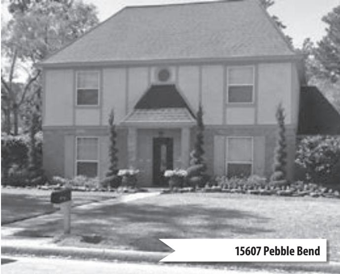
15607 Pebble Bend