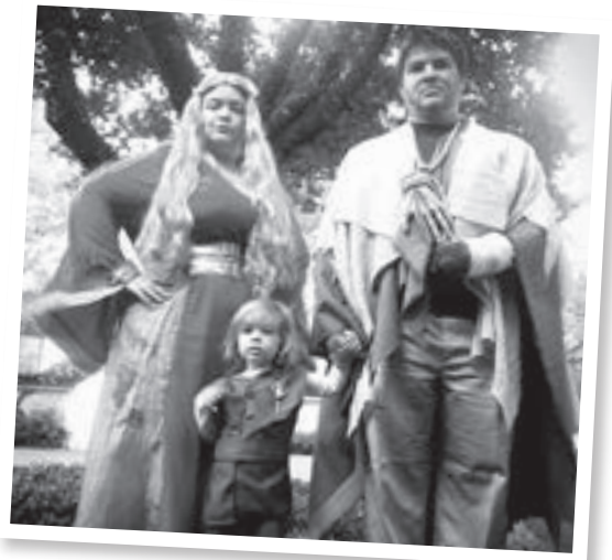
The Chaney family