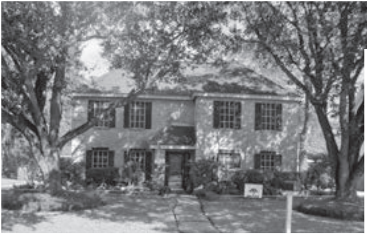
15130 Pebble Bend

Take a moment to appreciate these and all the lovely yards as you drive through the neighborhood! (images available in color at http://www.oocia.org )