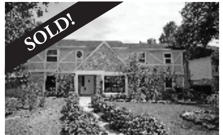
Olde Oaks | 3507 Aspen Bend MLS# 50475816 | 2521 SqFt Versatile floorplan. 3/2.5/2 with updated features..