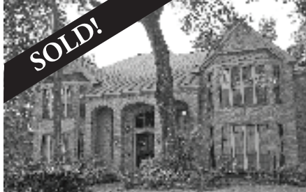
Olde Oaks | 3103 Mission Grove MLS# 44320419 | 3885 SqFt Fabulous custom on corner lot. High ceilings. 4/3.5/3 car garage.

Please contact me today if you are interested in buying or selling your home.