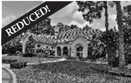
Estates of Northgate | 16810 Southern Oaks $829,900 | MLS# 28245489 | 6234 SqFt 5/5.5/3 in County Club and Golf Course community. Impressive golf course views in this tranquil home with impressive curb appeal.