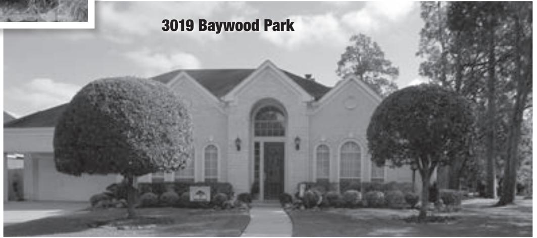
3019 Baywood Park