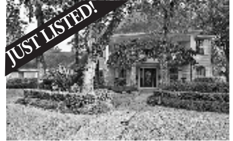
Lakewood Forest | 11218 Lorton Drive $412,000 | MLS# 15630991 | 3958 SqFt Nicely updated 4/3.5/3 with pool.