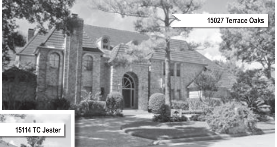
15027 Terrace Oaks

A big "thank you" to the October Yard of the Month standouts and to all residents who consistently enhance our community with their attractive, well-kept yards. (images available in color at http://www.oocia.org )