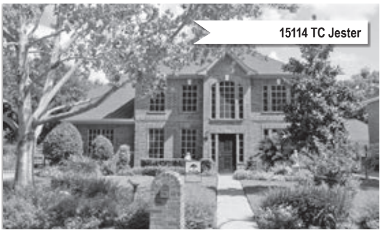
15114 TC Jester