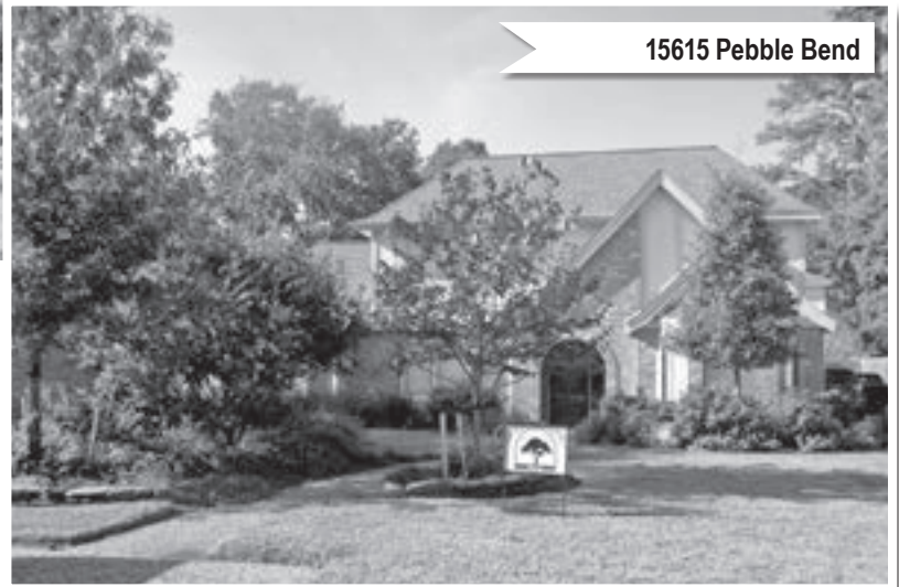
15615 Pebble Bend

Take a moment to appreciate these and all the lovely yards as you drive through the neighborhood! (images available in color at http://www.oocia.org )