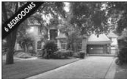
NORTHGATE FOREST | 3007 Pine Lake Trail $635,000 / MLS# 75359448 / 5918 SqFt Custom with quarters / Huge kitchen / Gated Driveway / Pool / new 50 YR metal roof