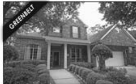
WATERFORD PARK | 15314 Beecham Cr $290,000 / MLS# 39505384 / 3545 SqFt Immaculate & versatile / Plantation shutters / Living room could be 2nd bedroom down w/full bath

281.433.2087 lbeck@garygreene.com www.LindaBeck.com