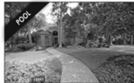
OLDE OAKS | 3115 Blackcastle Dr $335,000 / MLS# 66227492 / 3688 SqFt Park-like setting on 2.5 lots. Tiled entry. French doors lead to patio from master