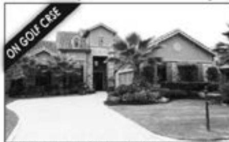
NORTHGATE FOREST | 16131 Villa Fontana Way $625,000 / MLS# 26552847 / 4217 SqFt Gorgeous custom home, Golf course views. Professionally decorated & landscaped