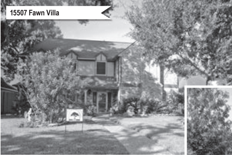
15507 Fawn Villa