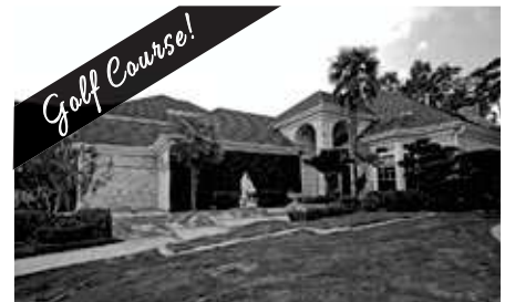
Greens Northgate Forest | 2711 S. Southern Oaks $319,900 | MLS# 7128876 Courtyard home with 2 bedrooms plus exercise room/media room, and 2.5 baths. Small intimate enclave on the golf course with gorgeous views.