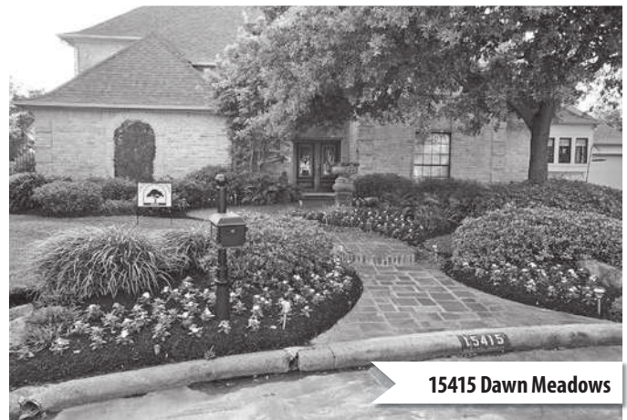
15415 Dawn Meadows