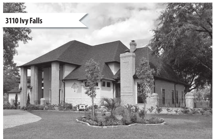
3110 Ivy Falls