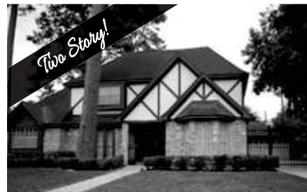
Olde Oaks | 3327 Woodbriar $235,000 | MLS# 3494289 Great house for a great price. 4 bedrooms, 3 baths and detached garage. 3,128 square feet.