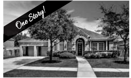
Waterford Park | 15322 Climbing Branch $377,000 | MLS# 5102542 Spacious one story with 4 bedrooms, 3.5 baths, study, formal dining and 3 car garage. Light, bright and gorgeous!