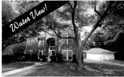
Waterford Park | 15202 Beecham $350,000 | MLS# 39957648 Small executive community. Master down with 4 bedrooms up. Beautiful home with pool. View of neighborhood pond.

Please contact me today if you are interested in buying or selling your home.