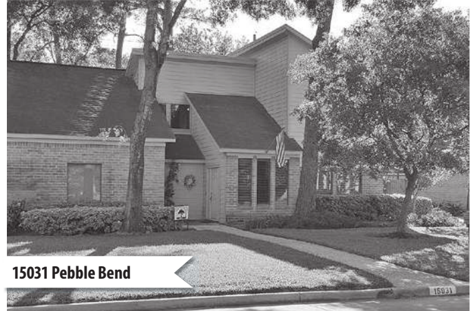
15031 Pebble Bend

Congratulations to our neighbors who inspire us all to maintain beautiful gardens! All those early April showers brought forth splendid spring flowers in time for Mother's Day!