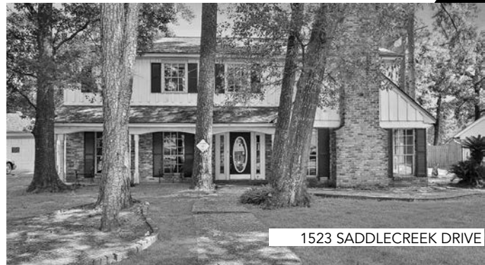
1523 SADDLECREEK DRIVE