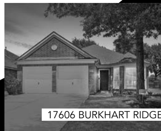
17606 BURKHART RIDGE