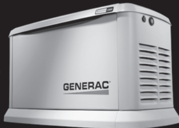
GENERAC HOME STANDBY GENERATOR