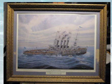
RELIEF sunk off Sandy Hook | STOLKHOLM and ANDREA DORIA collision | USS SAN DIEGO sinking.

For reservations, directions and more info call 732-456-5045 or email info@njhda.org . Pay admission at www.njhda.org or send checks payable to NJHDA, 107 Wilson Road, Neptune, NJ, 07753