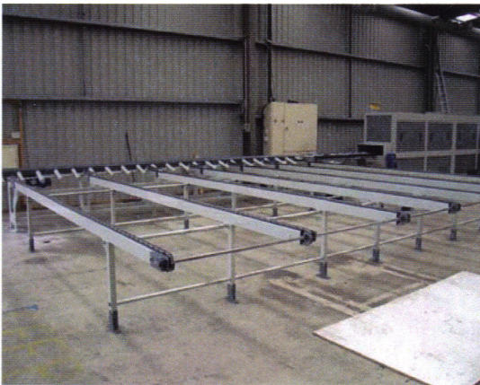
FE 5006 Lateral Cool Down

Line Speeds to 300fpm Board Lengths 3ft - 24 ft Board Dimensions ½" x ½" to 12" x 4" Powered Tapered Rollers @ 12" centers Lateral Transfer Belts B62 V Variable Speed Drive 440V/3-phase, 12cfm @80psi