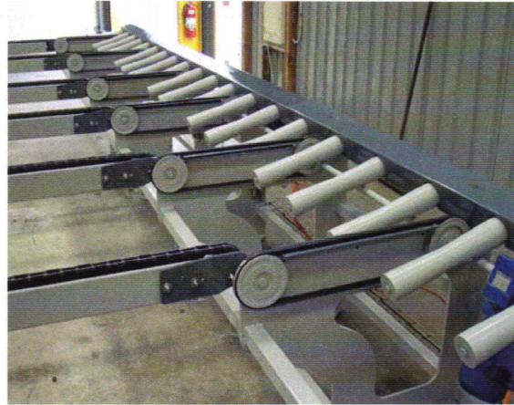
FE 6430 Lateral Drop Roll Outfeed

Line Speeds to 300fpm Board Lengths 3ft - 24 ft Board Dimensions ½" x ½" to 12" x 4" Plastic Non-marking Chains Tilt Roller Infeed Deck Powered Flat Rollers @ 12" Centers Top Pinch Rollers Pneumatic Operated 440V/3-phase, 12cfm @80psi