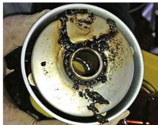
A filter clogged up with nasty diesel sludge

If reliance on a tank is great, it is important to prevent the bugs in the fuel from settling as this is when they become a problem. Enter the CTS Conditioning Unit.