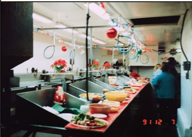
The fillet line at Cordero/Winston accommodated 10 fish filleters, but this day it held lots of good food for a Christmas party.