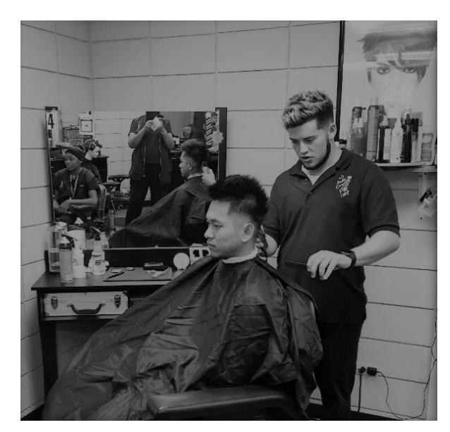
Hands on Training