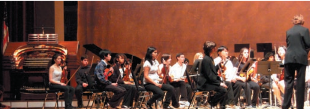
Berkeley High School Symphony Orchestra