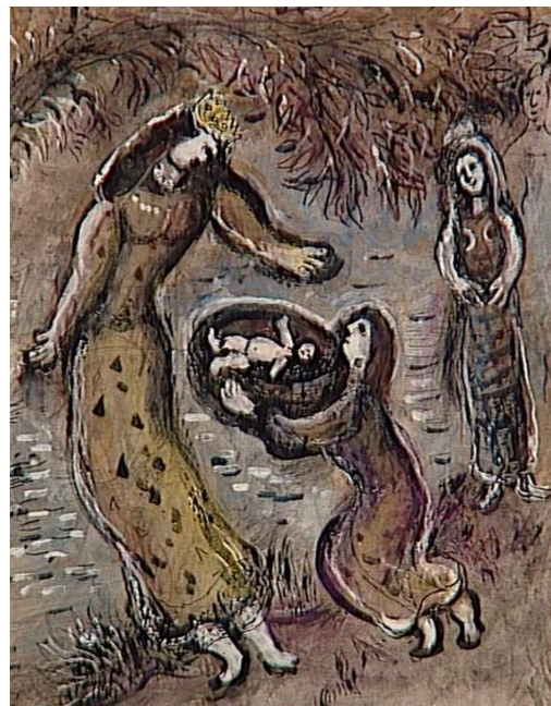
by Marc Chagall