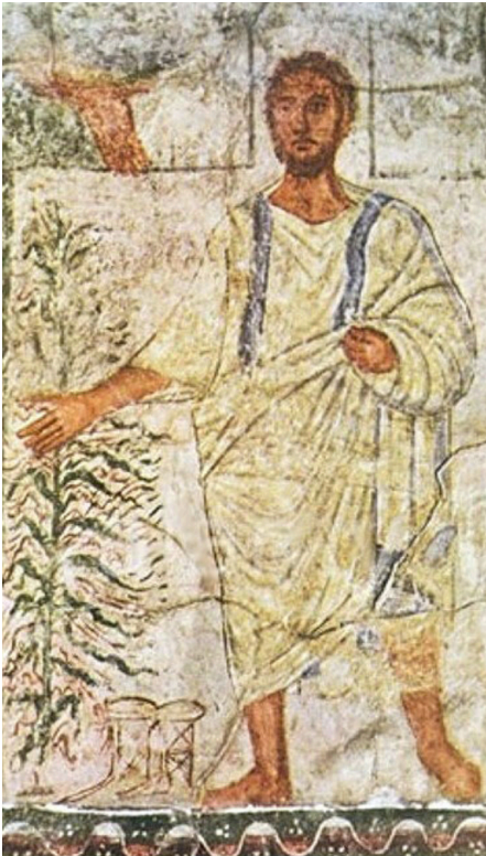
from the Synagogue at Dura Europos