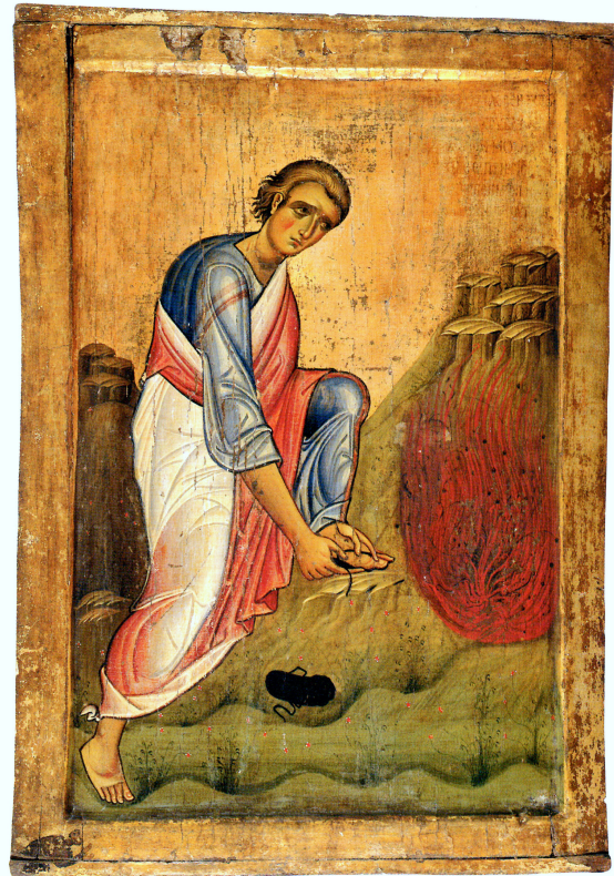
from St. Katherine's Monastery, Mt. Sinai