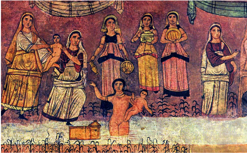
From The synagogue mural at Dura Europos