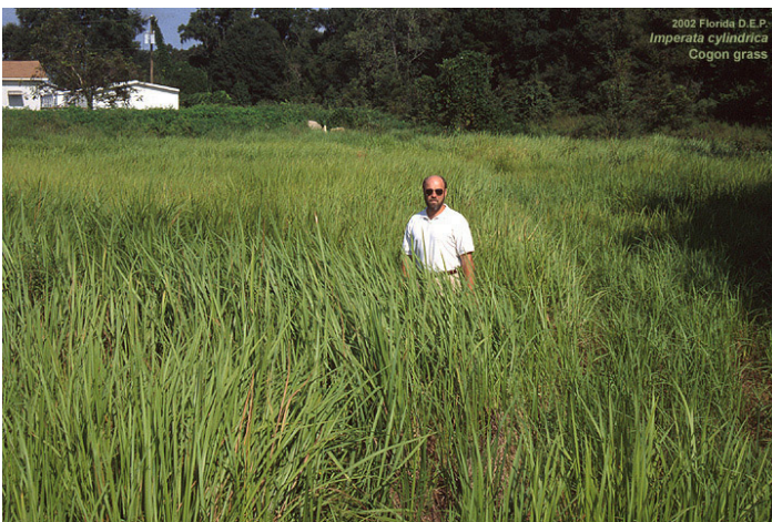
2002 Florida D.E.P. Imperata cylindrica Cogon grass

Learn to identify these invasive plants, and if they show up on your property treat them quickly before they can spread and increase the difficulty of controlling them. Treated areas should be periodically examined to determine if retreatment is necessary. It is normal for areas infested with invasive plants to receive multiple treatments to effectively reduce the impact and presence of these plants. The University of Florida's Center for Aquatic and Invasive Plants is a good place to find images and more information about these and many other species: http://plants.ifas.ufl.edu/ .