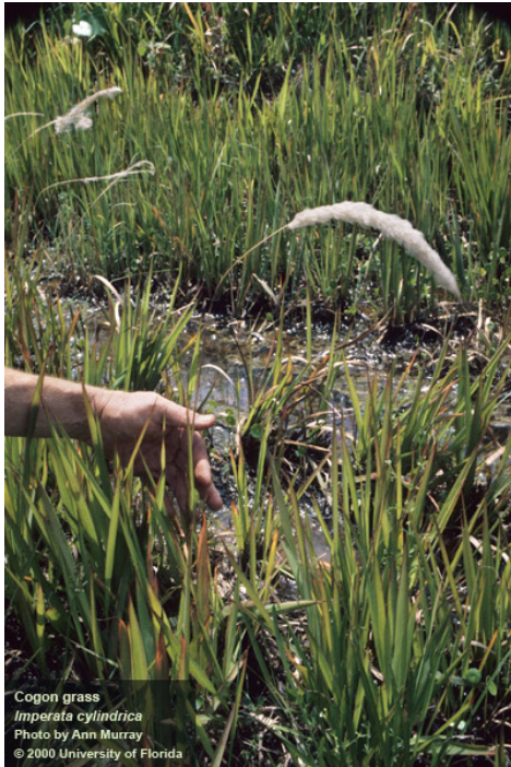
Cogon grass Imperata cylindrica