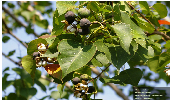
Chinese tallow Triadica sebifera

Chinese tallow, a.k.a. popcorn tree or tallowtree, was introduced by Benjamin Franklin from France as a source of candle wax and widely introduced from China in the early 1900s as an ornamental. It has since invaded most southeastern states. It is a small tree whose large, fleshy seeds are widely dispersed by birds and water runoff. The tree's attractive, light green, broadly ovate leaves that yield bright yellow and orange fall colors have made it a popular ornamental. It is also used by beekeepers for honey production in spring. However, this tree is threatening to become the prominent component of marshes, river margins, and dry uplands within its expanding range. Further planting of this tree is prohibited by the Florida Department of Agriculture and Consumer Services (FDACS), and it is listed as a noxious weed by the US Department of Agriculture (USDA) and as a Category 1 invasive weed by the Florida Exotic Pest Plant Council (EPPC).