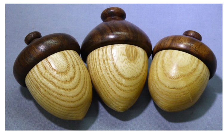
CUTS AND SCRAPES