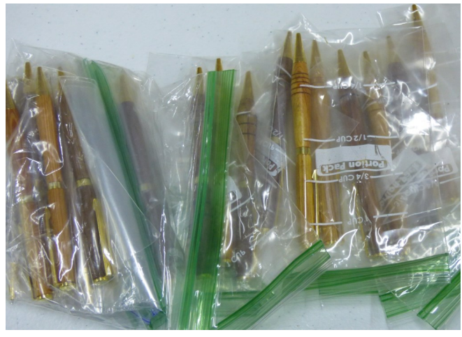
20 Pens for Troops 个 by Gene Payne