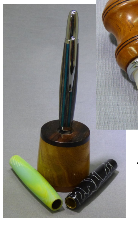
2 Bottle Stoppers ↑ ← Pulsar Prn & Stand By Peter Holt