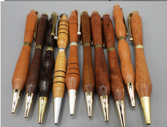
CUTS AND SCRAPES