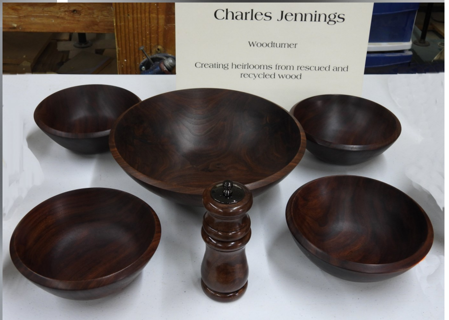
These items were all created by Charles Jennings