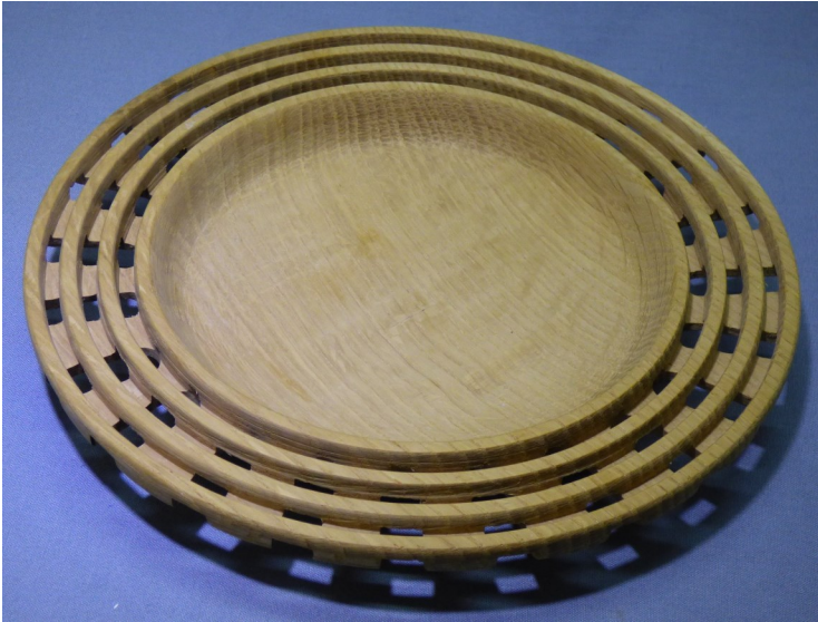
Bev deYapert designed and created this Oak bowl