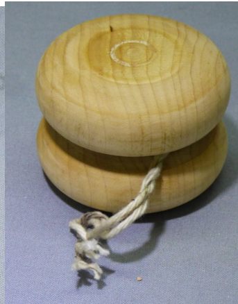
Items on this page were all designed and turned by Les Isbell