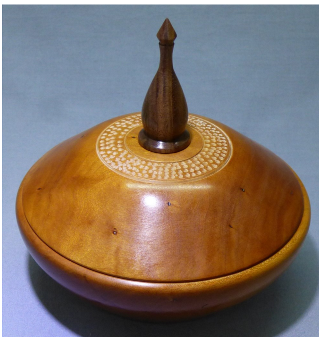
This lidded Cherry/Walnut bowl was created and turned by Gary Farlow