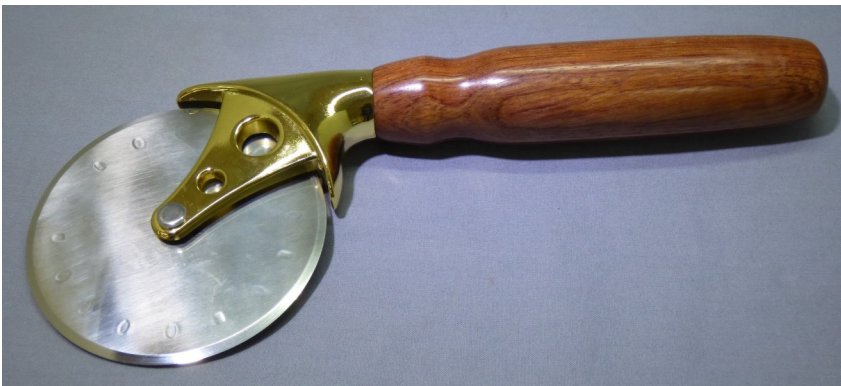
Pizza Cutter ↓ made by Dieter Kuberg and Pens for the Troops ↓