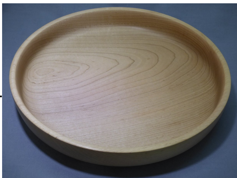
These items on the top were turned by Jerry Schnelzer